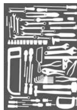
maintenance tools (panel 1)