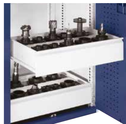
Drawer frames are also available for cupboards, see page 179.